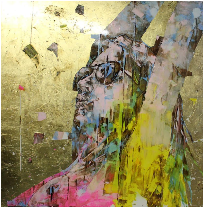
The Gold Experience no. 464, 2019 Oil on aluminium with resin 150x150 cm $23,000

Born in Milan in 1966, Marco Grassi now lives and works in Lugano (Switzerland). Grassi has spent the last decade creating works that remain faithful to his figurative style and avoid the whims of fashion and trends. His artistic language, and the subjects he chooses, highlight his unchanging vision and complex sensitivity, though his representations of the fashionable female figure, use of particular color combinations and lacquering, and series featuring subjects with minimal variation have led him to be inaccurately labeled as a Pop artist. Though Grassi chooses subjects who are delicate and attractive, these female figures are also energetic and resolute. Their representation in bright and fashionable colors echoes the Pop Art genre, but the subjects themselves are outside the confines of that artistic category.