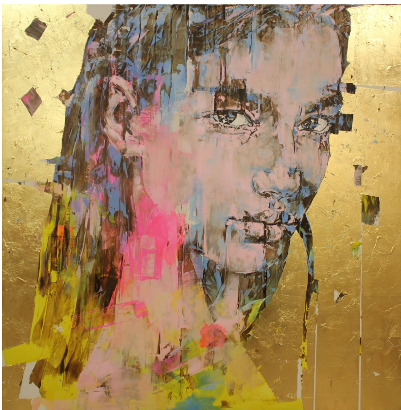
The Gold Experience no. 466, 2019 Oil on aluminium with resin 150x150 cm $23,000