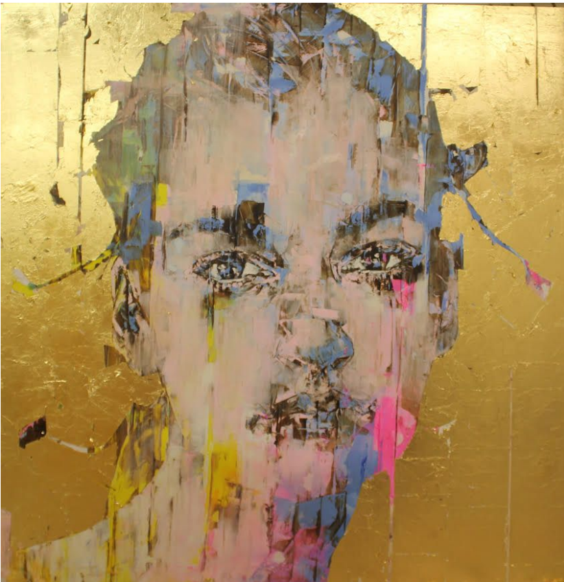
The Gold Experience no. 472, 2019 Oil on aluminium with resin 150x150 cm $23,000