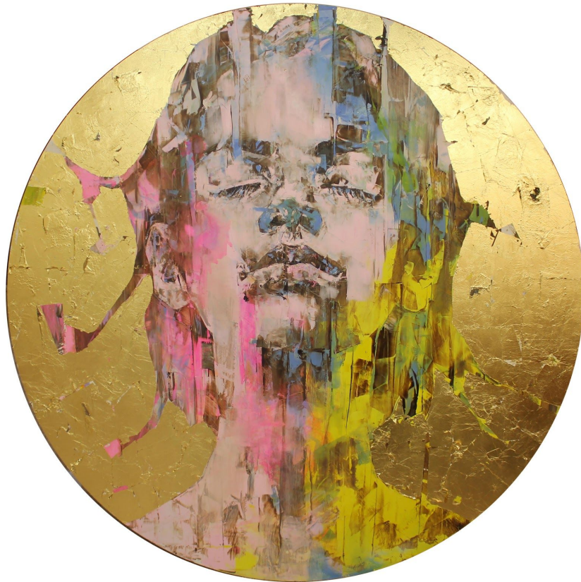
The Gold Experience Cameo no. 2, 2019 Oil on aluminium with resin 150 cm diameter $23,000