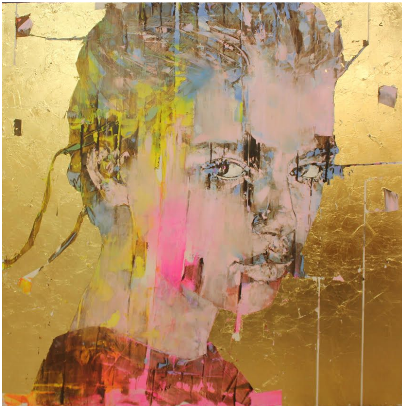
The Gold Experience no. 469, 2019 Oil on aluminium with resin 150x150 cm $23,000