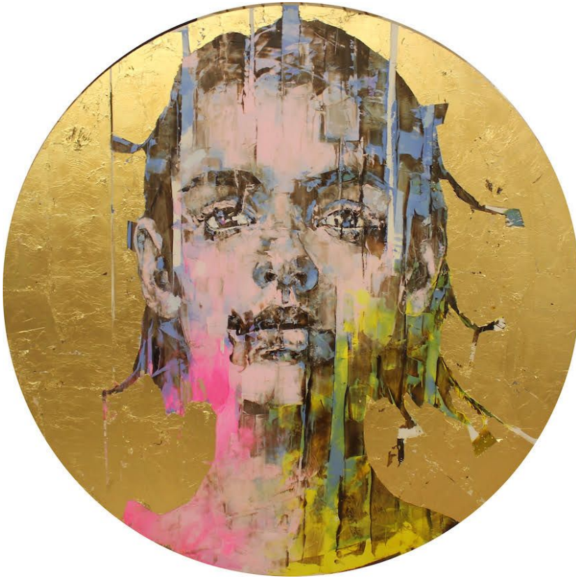
The Gold Experience Cameo no. 1, 2019 Oil on aluminium with resin 150 cm diameter $23,000