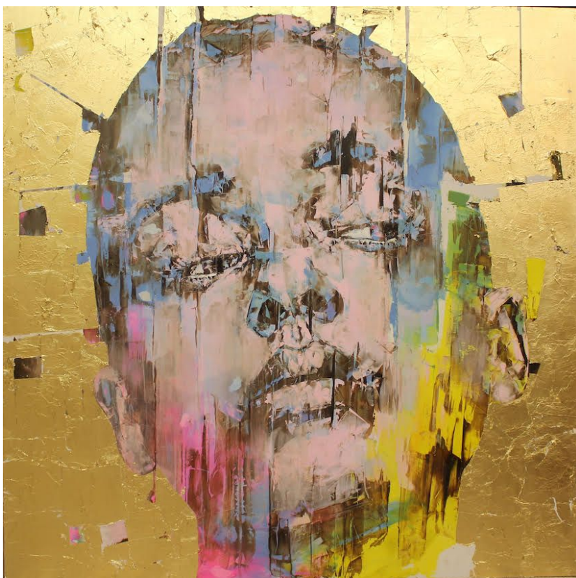
The Gold Experience no. 470, 2019 Oil on aluminium with resin 150x150 cm $23,000