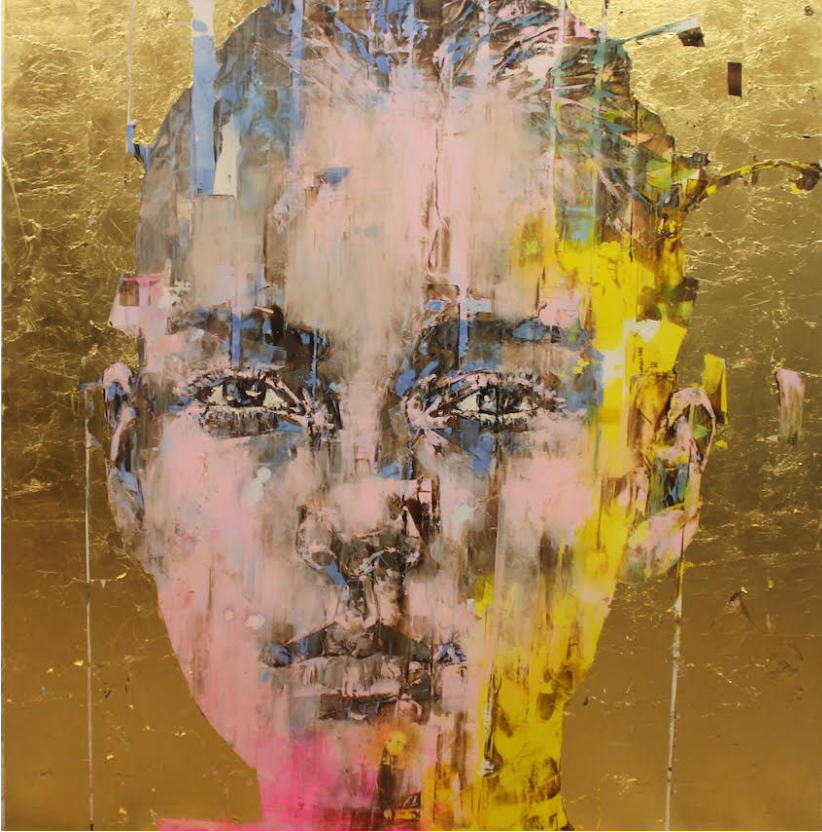
The Gold Experience no. 471, 2019 Oil on aluminium with resin 150x150 cm $23,000